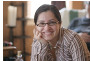
Christmas Morning Confusion (KC)

We'd love to hear how you deal with large families and the holiday season, whatever you celebrate - logistics transcend all. ☺